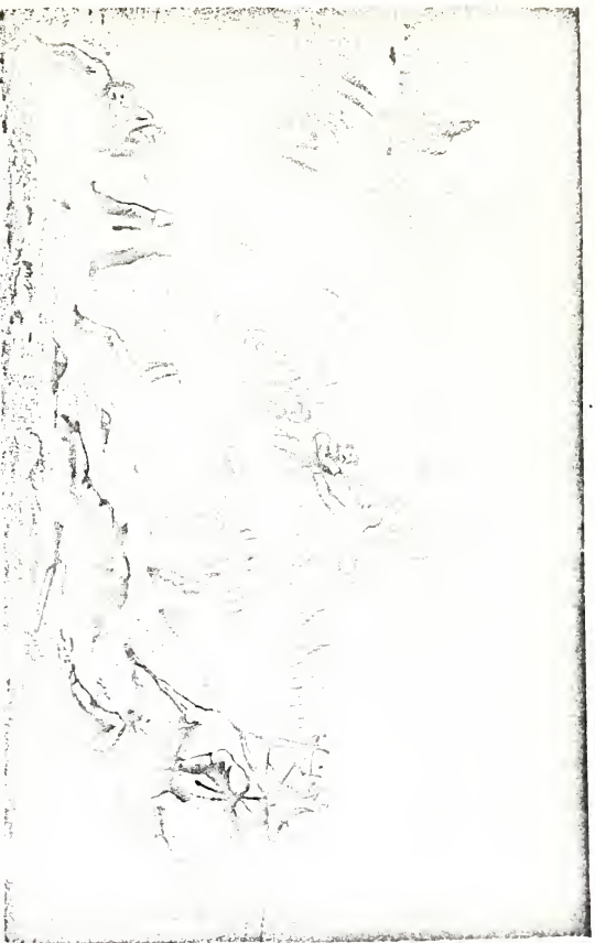
The Charge at Rappahannock Station.